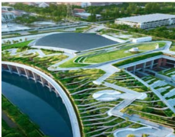
Thammasat University Rooftop Farm, Thailand Asia's largest rooftop farm with UltraPly TPO covering 20'000 m² green roof