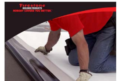
New FullForce highly reflective, self-adhering membrane

Environmental and energy efficient solutions