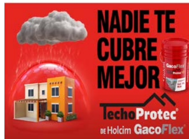
GacoFlex "TechoProtec" liquid applied waterproofing and roofing solutions for residential and commercial applications

Holcim GacoFlex TechoProtec launched in Mexico